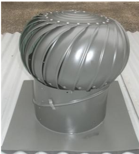
Windmaster Ventilator 300mm Zincalume