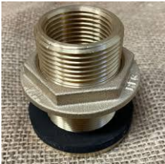
2" Brass Outlet and Valve (Drain) Profiled Flange Nat Rubber 50NB