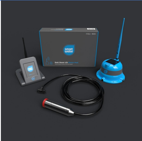
RainBear Smart Level Monitoring Package

Tank level monitoring via app & local LCD display Compatible with optional pump controllers, automated valves, and audible level alarms.