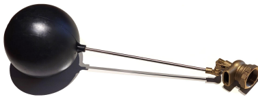
Mechanical Float Fill Valve System

Non-electronic valve automatically maintains the level in the tank with filtered well water. Oversized valve and float for reliable operation, manual shutoff valve, tank bulkhead penetration, freeze protection, trenching, and piping included. Additional piping/trenching may be required depending on source location.