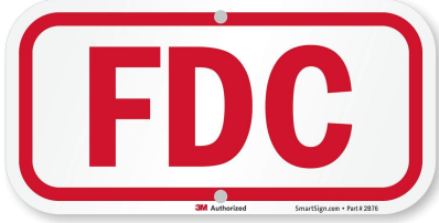
6"x12" Retroreflective FDC Signage