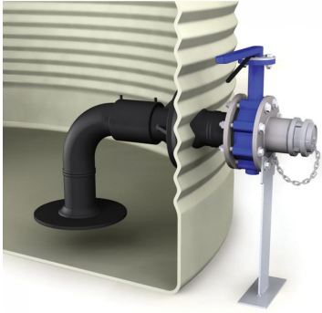
4" Anti-Vortex Fitting