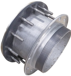
Carbon Steel 6" Flange with FD specified connection