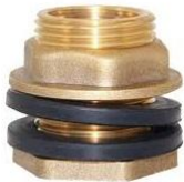
2in NPT 2" Brass Bulkhead Fitting with NPT Thread (Inlet)